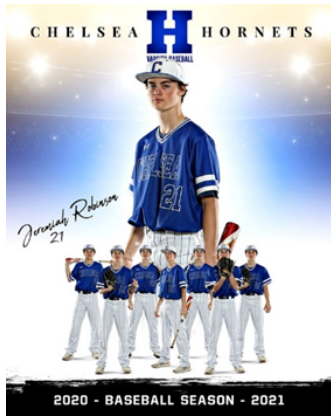
16X20 POSTER - M11 $85